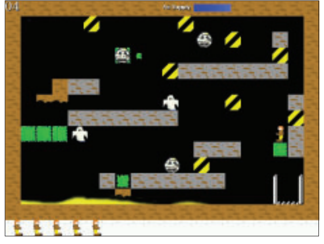
Figure 3: The completed game

SDL_Surface *pImg; pImg = SDL_LoadBMP("gfx/dugicon.bmp"); SDL_SetColorKey(pImg, SDL_SRCCOLORKEY, SDL_MapRGB(pImg->format, 0, 255, 0)); SDL_WM_SetIcon(pImg, NULL); SDL_FreeSurface(pImg);