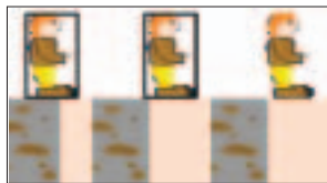
Figure 2: The bounding box does not always reflect the graphics

This is not an uncommon trade off, as any problems in the collision code are as annoying for the player to play, as they are for the programmer to program! The player could walk into an alcove, play a "scratch nose" animation, and then find that one particular pixel is in collision with the world, and he can no longer walk out. So, we specify to